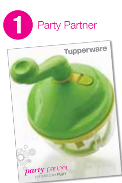
1 Party Partner