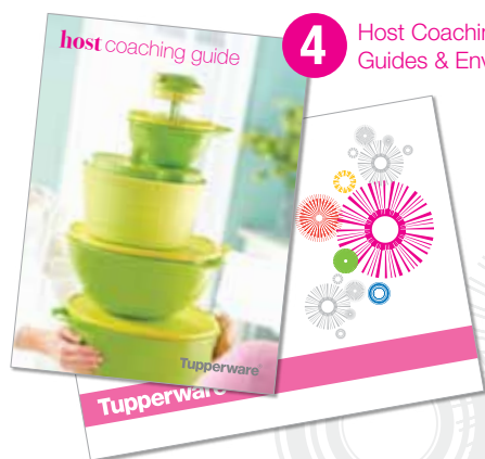
4 Host Coaching Guides & Envelopes